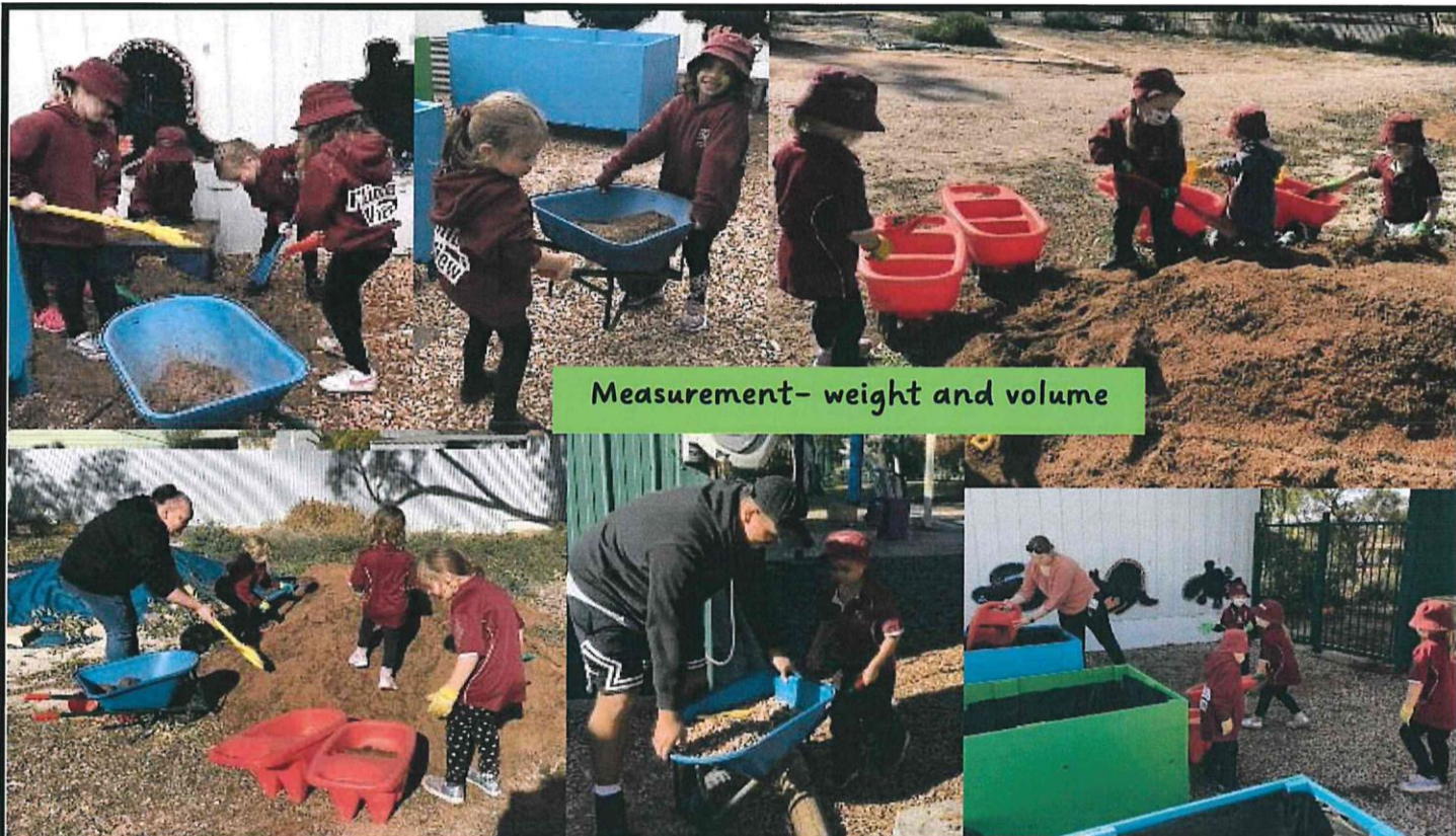
Measurement- weight and volume